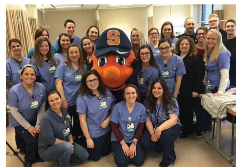
College of Nursing with Otto the Orange

They needed to capture hospital scenes, so our lab was the next best thing! Watch for a Christmas movie entitled "Old Acquaintance Be Forgot" to see if you recognize your alma mater!