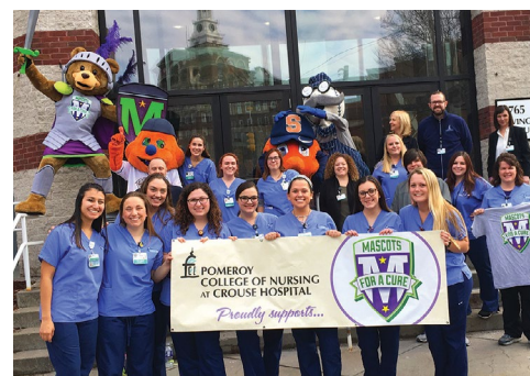
College of Nursing supports the Mascots for a Cure