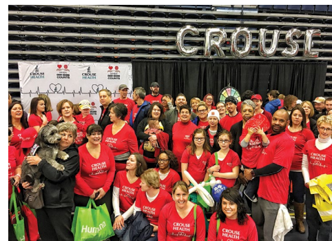
College of Nursing supports the Heart Walk