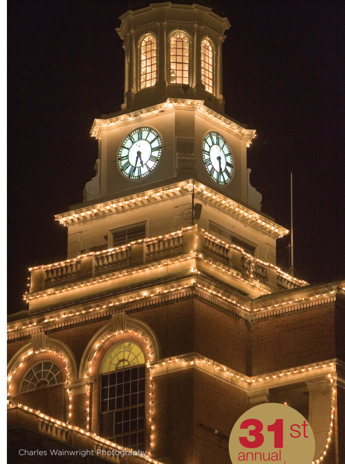
Charles Wainwright Photography