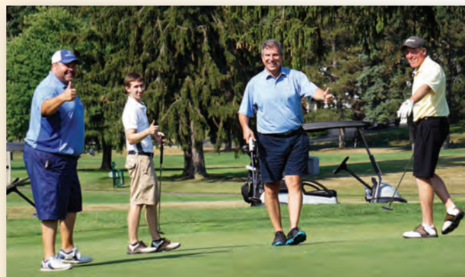
BPAS Actuarial & Pension Services golfers enjoyed the morning session.

Net proceeds from the tournament were used to purchase fiber-optic endoscopes for the Baker Regional NICU. Specifically sized for tests and procedures for newborns, this equipment is the most advanced for diagnosing and treating gastrointestinal and respiratory ailments in premature and critically ill babies. These scopes feature state-of-the-art optical imaging technology that enhances the visibility of vessels and other tissues and, through special brightness and contrast displays, a physician's viewing distance is virtually doubled.