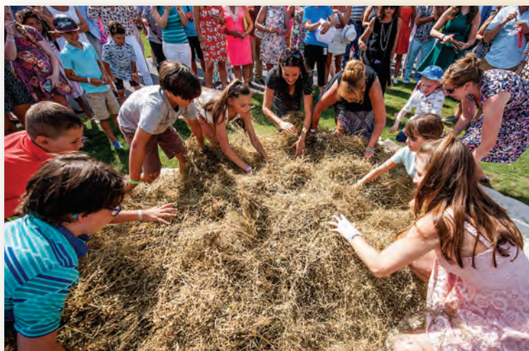
Attendees participate in the Needle-in-the-Haystack competition to win a ring donated by Cazenovia Jewelry.