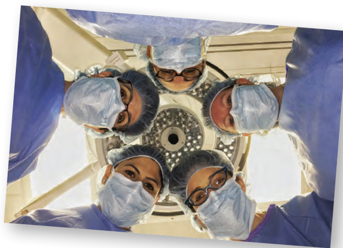
The Caduceus Circle recognizes generous physicians who make an annual contribution to the Crouse Health Foundation to enhance care for patients, families and the communities we serve.